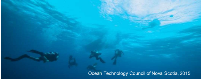
Ocean Technology Council of Nova Scotia, 2015

In the oceans technology sector , oceanographers conduct targeted research to provide advice and support to governments and/or industry on a broad range of ocean issues, including sovereignty, safety and security, safe and accessible waterways and the sustainable use of natural resources.