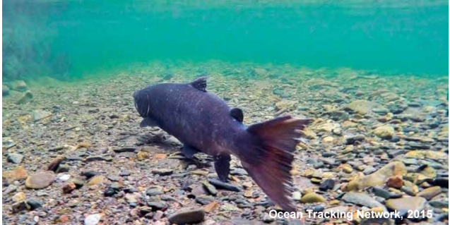
Ocean Tracking Network, 2015