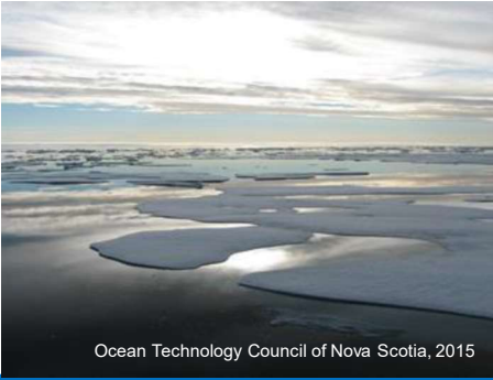
Ocean Technology Council of Nova Scotia, 2015