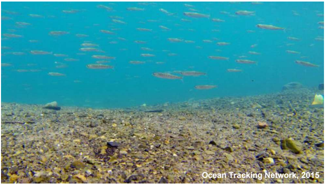
Ocean Tracking Network, 2015